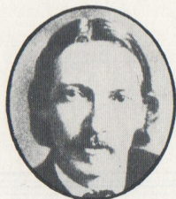
Robert Louis Stevenson

“Good luck, my friend . . . until our next meeting.”