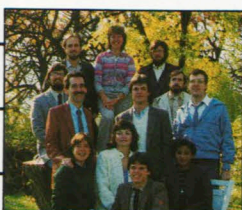
Action Graphics, adaptors for the Atari® 5200