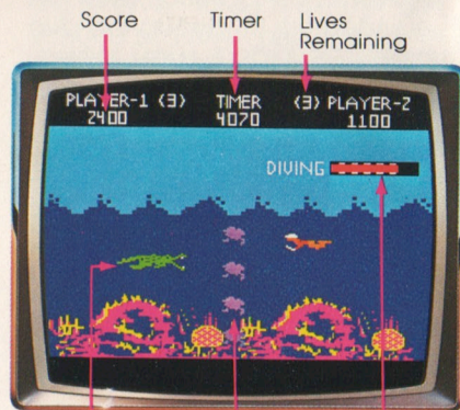
Crocodile Mysterious Murk Air Meter,

You're given three lives at the start of the game. At 10,000